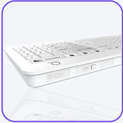
SEAL INTERFACE DESIGN